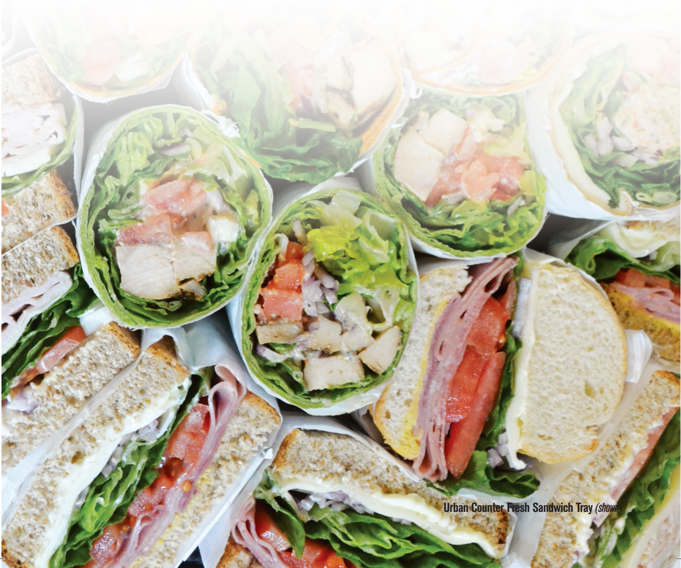
Urban Counter Fresh Sandwich Tray (shown)