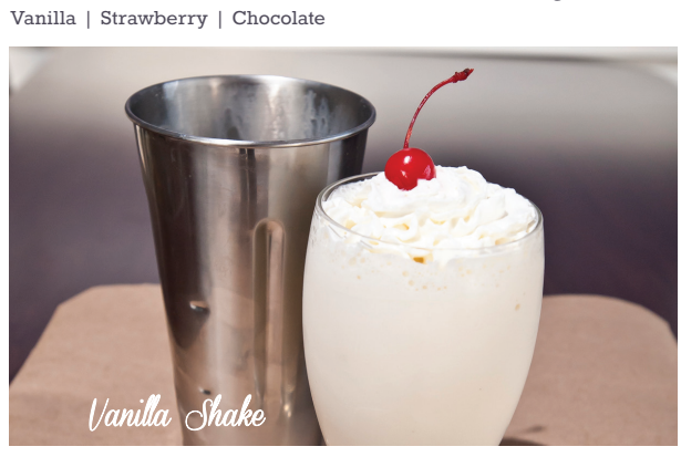
Menu subject to change without notice